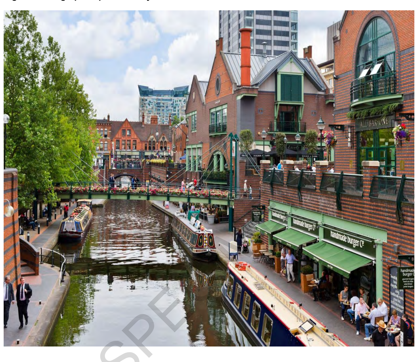
Fig. 1 - Photograph of part of a city in the UK in 2014